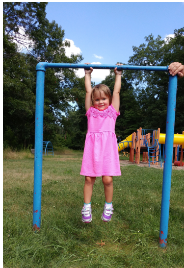
Hanging out at the park.