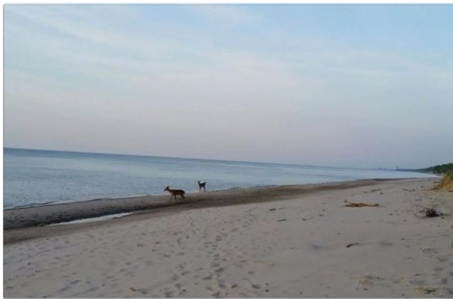
Deer on the beach near Hill Drive during a sunset in May.