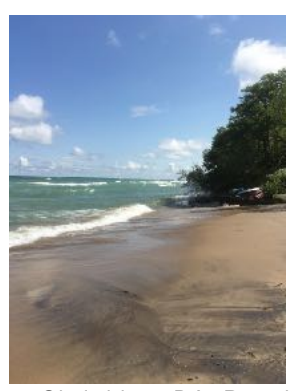
Shrinking DA Beach Shoreline.

You can't really be a "beach community" without access to the beach! So the decades