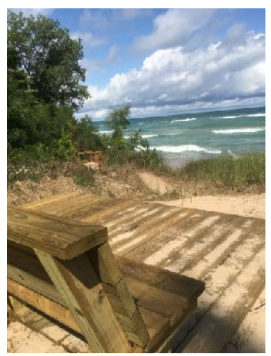
Other DACIF projects this year Ridge Beach Viewing Deck.

In addition to the pathway, DACIF provide the funds for construction of an intimate deck with seating that overlooks the waves below and the Chicago skyline in the distance.