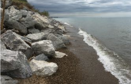
DA Lake Michigan seawall protection.