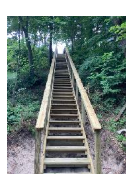
Cooperation With Town Council and Administration planning and coordination.

As Lake Michigan continued to encroach on the Dune Acres roads and parkland, the final months of 2019 saw