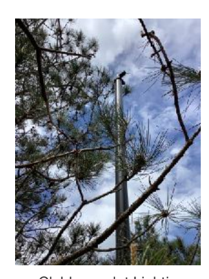
Clubhouse lot Lighting

And, speaking of the clubhouse area, there were other enhancements and restoration that took place there as well. To complement the drive repaving and parking lot regraveling funded by the town, DACIF contributed the funding for new