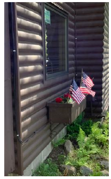
Welcome to Dune Acres!

provided the financial donations that empower DACIF to fulfill its purpose as stated in the Articles of Incorporation "To economically assist the Town of Dune Acres". He noted, "DACIF is not the source of the funds to enhance our community . . . it is those residents who step forward with generous (tax-deductible) donations that enable the foundation to fulfill its mission of enhancing the wholesome environment of the community which is our home." He continued, "We look forward to continuing our support of projects that will enrich our community."