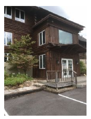
Clubhouse Exterior Refurb.

lighting. Unsightly wooden poles that supported aging parking lot flood lights were replaced with sleek new aluminum masts that feature lighting fixtures that are "Dark Sky" compliant.